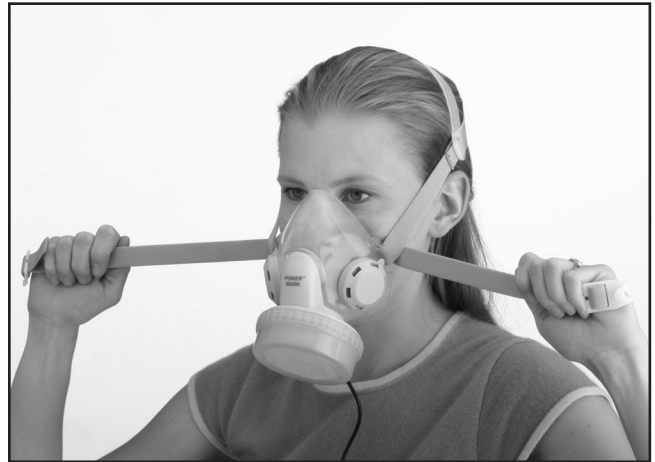
Figure 4. Adjusting the side straps.