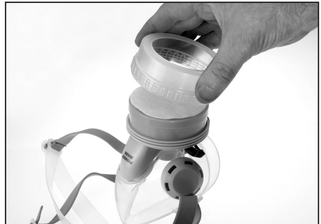
Figure 2. Cartridge cover removed.