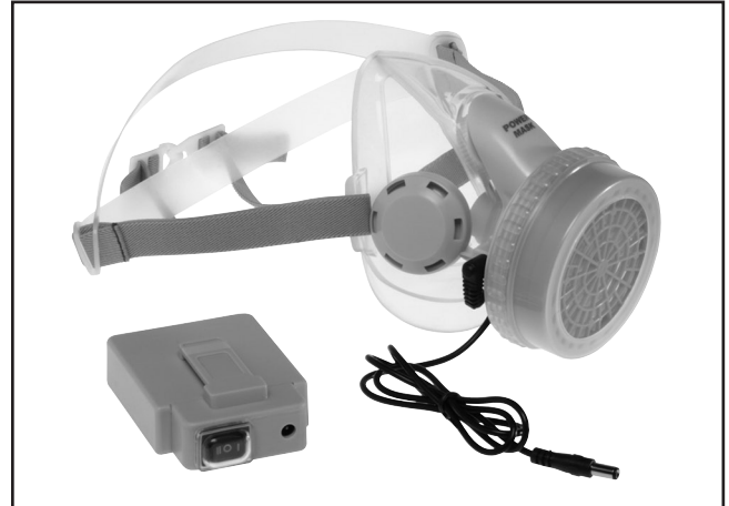
Figure 1. Model H6175 Half Face Power Mask.