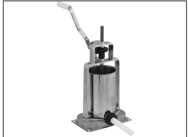
Figure 1. 5 lb. Vertical Stuffer.