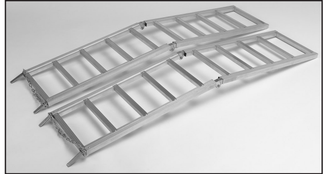
Model H7593 ATV Trailer Ramps.

READ and UNDERSTAND these instructions before you use these ramps, DO NOT modify these ramps in any way, or severe injury or death may occur.